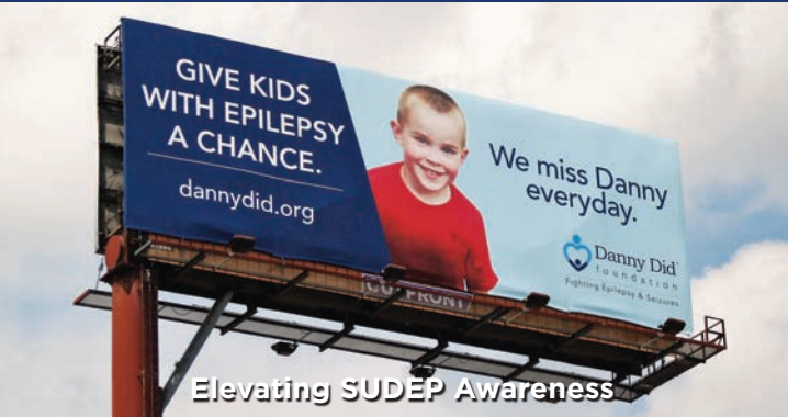
Elevating SUDEP Awareness