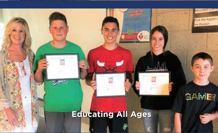
Educating All Ages