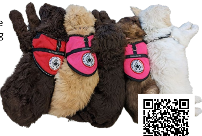
Scan to support the cost of training a service dog